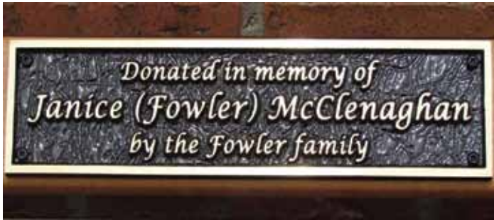
Custom Bronze or Aluminum Plaque